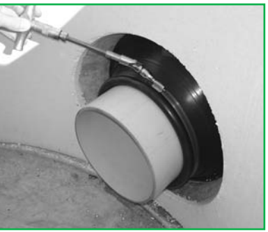
INSIDE Z-LOK CONNECTOR INSTALLATION

Attach proper size clamp beside o-ring then center pipe in connector and VERY IMPORTANT tighten clamp with torque wrench to 60 inch pounds.