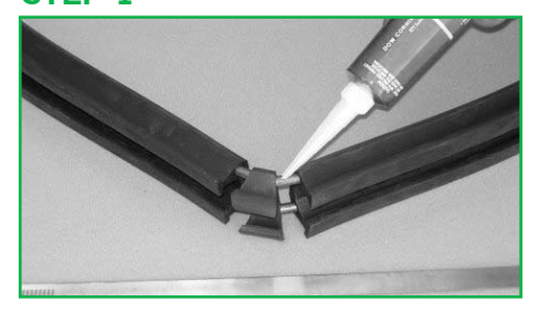
Insert pins in wedge and apply glue to both sides of wedge.