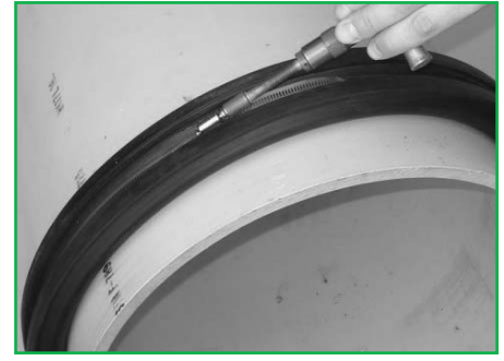
(Fig. 1) Tightening down one piece spliced WATER-STOP with torque wrench prior to grouting.

Connectors easily install to the outside diameter of corrugated or smooth wall pipe. Designed for use with new or existing round or flat wall structures to seal cold joint pipe penetrations.