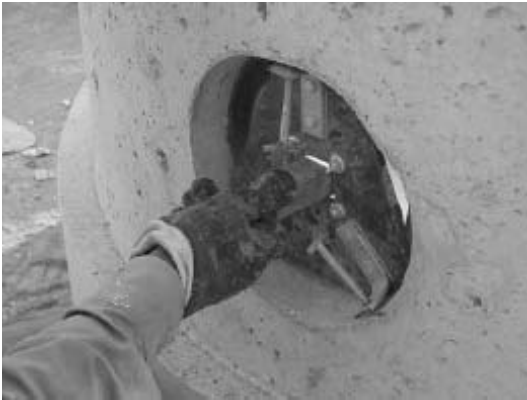
#1 ASSEMBLY STARTS WITH CENTERING TRIANGLE IN LOW HOLE