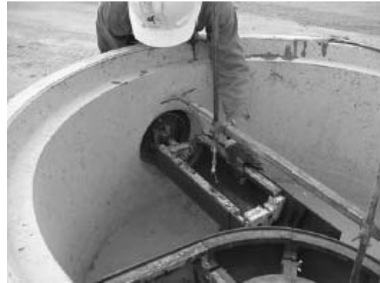
#4 POSITION ANTI FLOTATION BAR AND ADDITIONAL CHANNEL