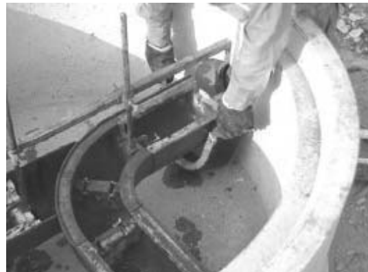
#5 POSITION HUBS