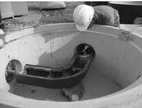
#3 SMALLEST ANGLE ASSEMBLY IN LOW HOLE AND UPSTREAM SIDE.