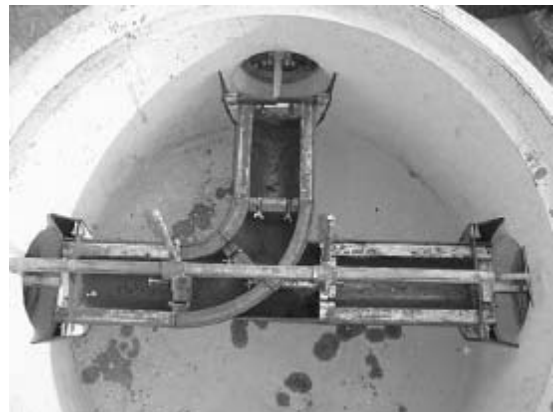
#6 COMPLETED THREE-WAY ASSEMBLY READY TO POUR

ANY QUESTIONS REGARDING TRU-CONTOUR INSTALLATION, PLEASE CALL 1-800-822-2565