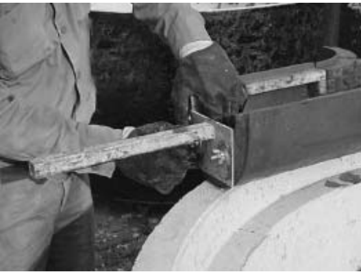
#2 ASSEMBLE SMALLEST ANGLE WITH CENTERING ADAPTOR